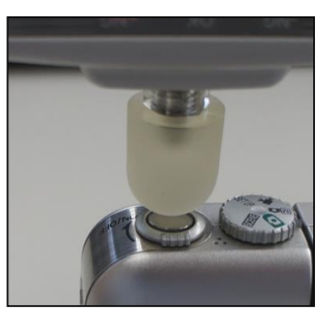
Camera shutter button feeling test