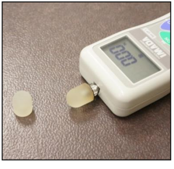
Combined with a force gauge